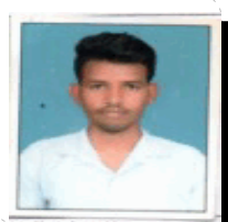
Hall ticket No: