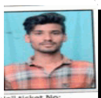
Hall ticket No: